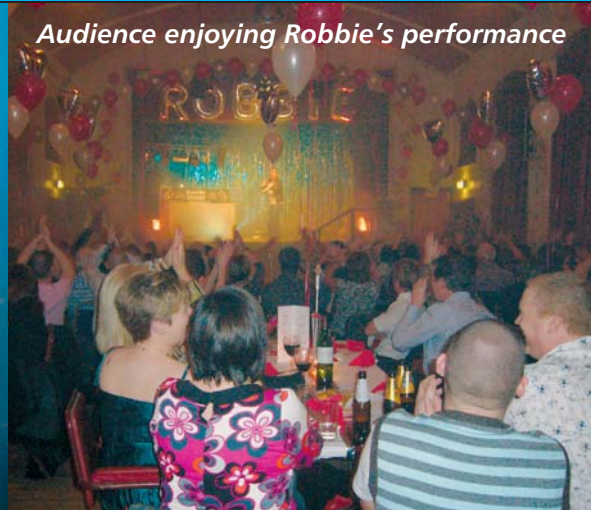
Audience enjoying Robbie's performance